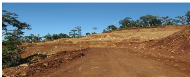
Alpha Excavation Pit