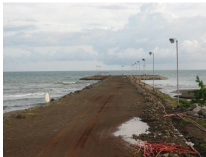
Pier for Shipment

MBMI has entered into definitive agreements with a local company DMCI Mining Corporation relating to properties in the Palawan province of the Philippines. The primary aim of the transaction is to strengthen MBMI's position in Philippines. While the execution of the definitive agreements marks an important step forward in this regard, a number of challenges remain to be overcome before the Palawan Properties can enter production in earnest. In particular, MBMI expects that it will be required to secure additional financing for its other operations and prospects in the Philippines, for its Canadian oversight and management operations, and to fund the maintenance of MBMI's operations on the Palawan Properties until the Pending Cases are resolved.