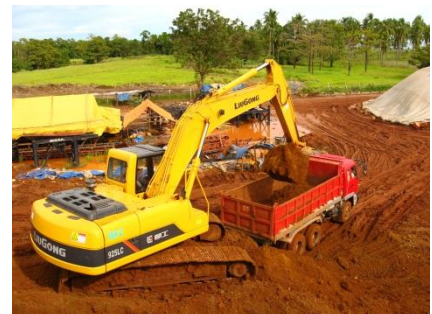
Stock Pile Delivery